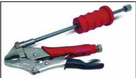
Slide hammer attached to top of locking pliers provides an added jolt of pulling power.

Vegas Tool, 1191 Center Point Dr., Henderson, Nevada 89074 (ph 702 992-0202; www.lasvegastool.com).