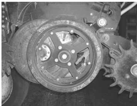
Open spoke design of new replacement gauge wheels keeps them free of mud.