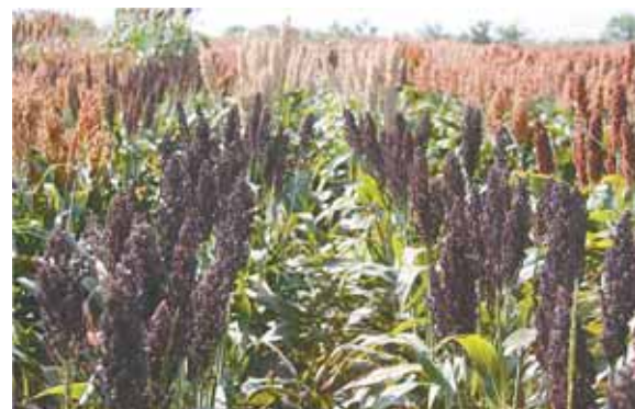
Onyx black sorghum has high levels of antioxidants known for their health benefits.