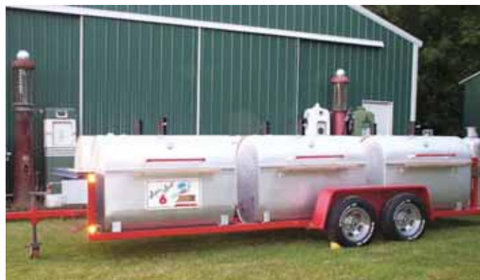
Bob Prom can cook 6 hogs at a time using this home-built barbecue tandem axle trailer, which is fitted with six 5-ft. long roasters.

"The roaster lids are heavy, but I don't use counterweights to help raise the lids and hold them in place because I don't want people looking in and possibly getting hurt," says Prom. A temperature gauge and a smoke stack are located just above each lid's handle. "I can