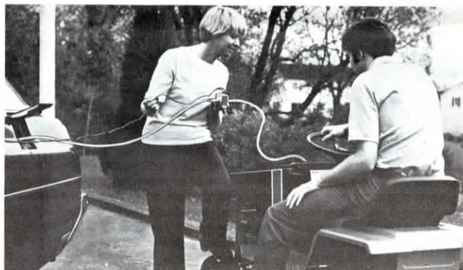
Electric Handi-Pump plugs into cigarette lighter for out-of-gas emergencies, or for fast filling of lawnmowers, snowmobiles and other small engines. Pumps 2 qts. per min.