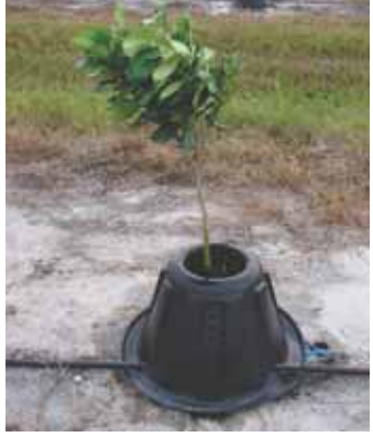
Water hose runs through holes at base of cone to a microjet nozzle mounted inside the tree T-PEE.

The tree T-PEE retails for $5.95 plus S&H.