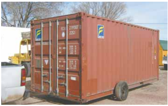
Ken Dobson used scrap metal and axles from an old motorhome to make a dolly system for moving metal shipping containers.