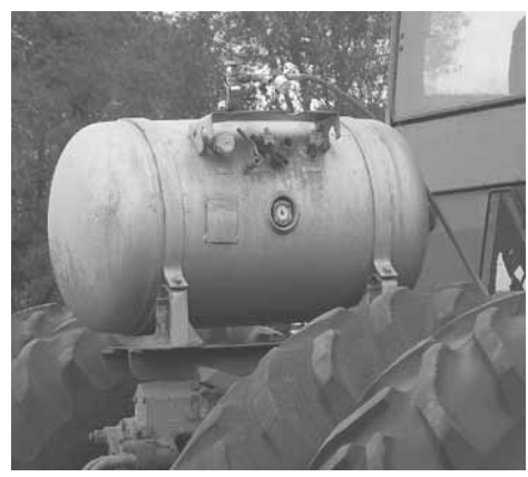
Propane Enhancer injects a little propane into diesel engines for faster speeds, more power, and a cleaner burn in tractors and trucks.

He says the propane simply helps burn diesel fuel more efficiently. Typically, he explains, only about 75 percent of diesel used is burned. With the propane injected, efficiency jumps to 98 percent.