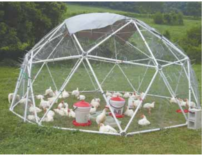
Thanks to the connecting hub design, one person can assemble the frame for a 16-ft. dia. Zip Tie Dome within a couple of hours.

Contact: FARM SHOW Followup, Maestro-Gro, 613 Colorado St., Justin, Texas 76247 (ph 940 648-5400; cbeckett@maestrogro.com).