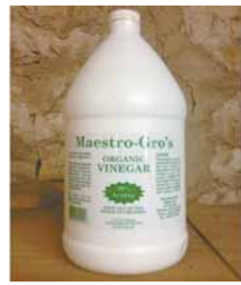
Agricultural Vinegar kills on contact by drying out the plant.

"It's safe for the environment, very economical and can be purchased from many different vendors. Most agricultural supply stores can order it in for you or it can be found on-line or mail ordered. Size ranges from gallon jugs to industrial-sized totes. Prices range anywhere from $13 to $15 per gallon but is lower if bought in larger quantities.