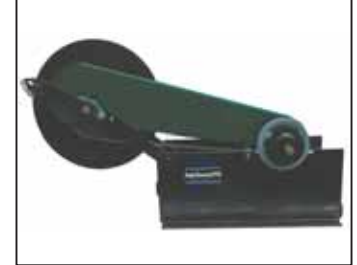
Unit's 20-in. flywheel projects toward the person pedaling.

"The driveshaft is long enough to mount up to three pulleys or sprockets between