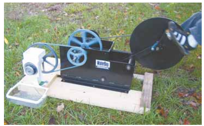
Pedal-powered pto work station can be used to operate any low rpm tool, including alternators, grain grinders and even power shop tools.