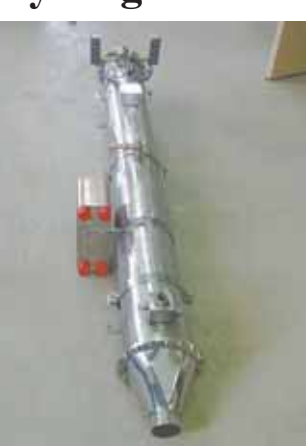
Heat Collar channels exhaust through a pipe filled with small tubes, capturing otherwise wasted heat from stationary engine exhausts.

"Every 1,000 cu. ft. of natural gas your