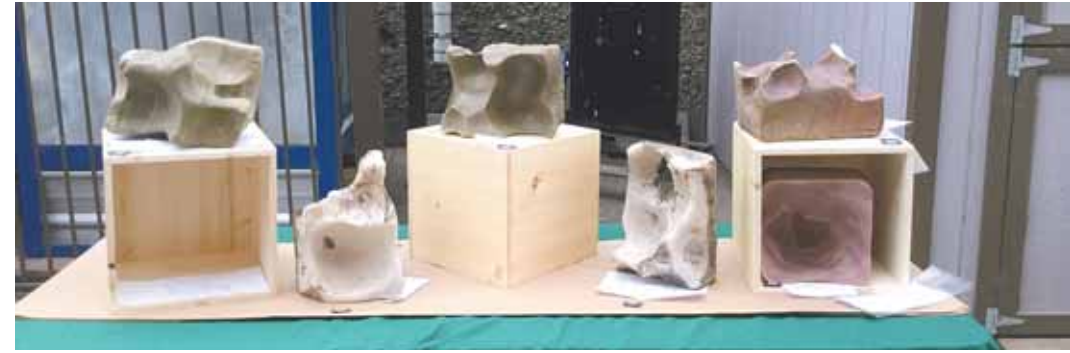
The Salt Lick contest is an event where 50-lb. blocks of salt licked by livestock into artistic shapes are submitted by local ranchers and put up for bidding. Most of the auction proceeds go for research into Parkinson's disease.

The idea is to collect salt blocks from ranchers across the county, award cash prizes to the best one, and then auction them off to the highest bidder. Local merchants participate, and anyone who brings in an already licked block of salt get a brand new block in return.