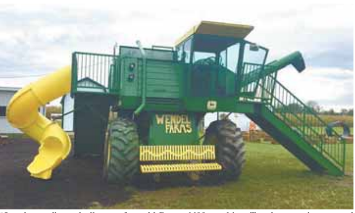
"Jungle gym" was built out of an old Deere 6600 combine. Two large stairways and platforms were added around the cab with a large slide on one side.

For more information about the Salt Lick Visit (www.whitdeschner.com; ph 541 519-2736)