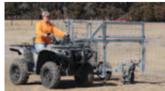
One person can now easily and safely process calves with Leo's Safety Zone Calf Catcher.