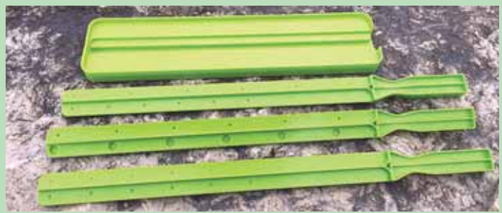
Paddles fit into channel down center of seed tray (top). Seeds are then poured into tray to fill holes in paddle. Then paddle is removed and tipped over garden furrow.

Contact: FARM SHOW Followup, EarthApples, Phil Bakker, 4 Legend Trail, Stony Plain, Alberta Canada T7Z 0B1.