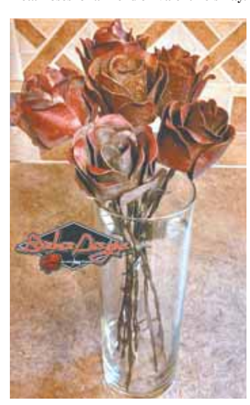
He credits the color quality to his education and experience in collision repair and body shop work.

usually comes during slower times on the ranch - before Valentine's Day, Mother's Day, Christmas, etc. During calving, and haying and harvest seasons, it takes longer to fill orders.