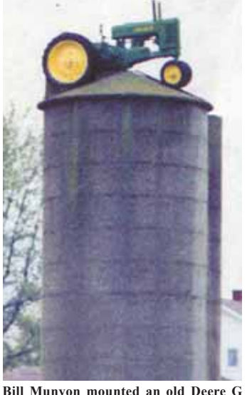
2-cyl. tractor on top of this 30-ft. silo for

The tractor is chained down and also secured with cables at several places to the silo's roof. "I took the air out of the tires so the tractor can't roll. Heavy winds have come