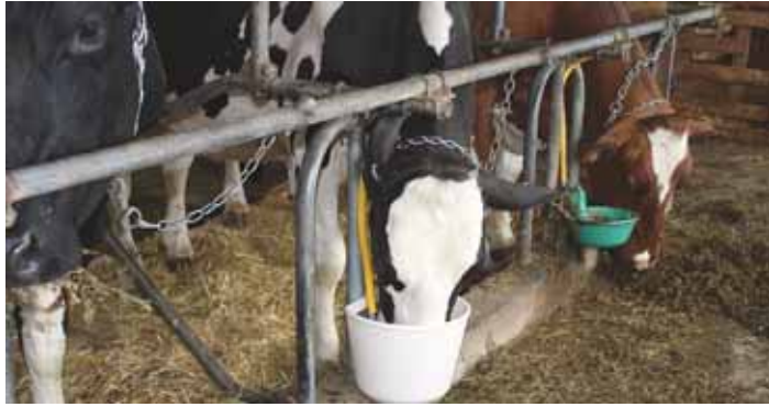
Kendu Zero Spill water bowl is deeper than regular bowls and has a high-flow tube valve located low inside it. Cows can't raise water level above 2 in. unless they bury their noses in water and hold the valve down.

He adds that the high rim of the bucket reduces the chance of a cow lifting feed into the bucket, and the high flow valve scours