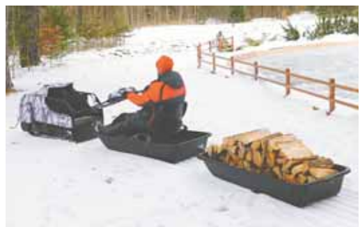
SnowDog power unit pulls rider on a sled. It goes up to 20 mph and can tow up to 1,100 lbs.

Contact: FARM SHOW Followup, Charlie Trayer, 253 CR 211, Seymour, Texas 76380 (ph 940 453-6708; www.charliescowdogs.com; trayer@windstream.net).