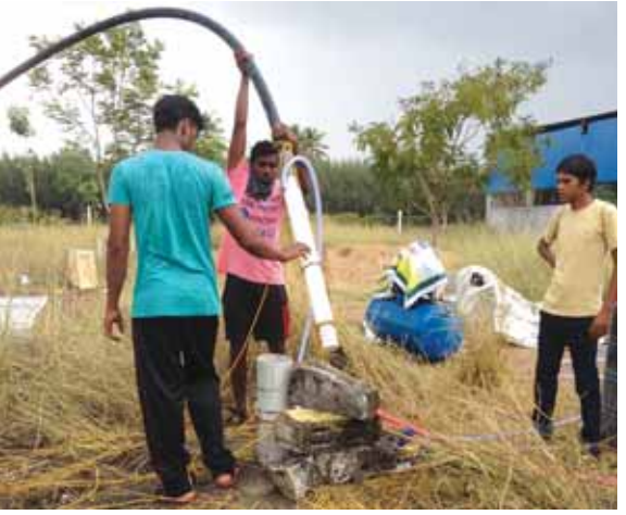
Brumby submersible pumps have been used for years for their cost savings and ease of installation.

Contact: FARM SHOW Followup, Agri Supply, P.O. Box 799, Garner, N.C. 27529 (ph 800-345-0169; tech@agrisupply.com; www.agrisupply.com).