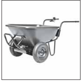
Pro PAW is powered by a 24-volt battery and DC motor to help move heavy loads.

frame for durability. The tub is a 6-cu. ft. heavy-duty poly tray. There's also a heavyduty curved dump brace on the front to make it easier to unload the wheelbarrow.