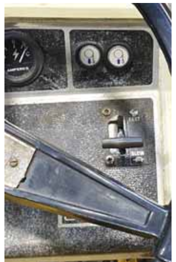
Up and down dash controls via a winch connected to the battery.

brace of the hitch is especially handy, pulling his wood splitter, a yard trailer and moving trailers their metal shop builds to the parking lot.