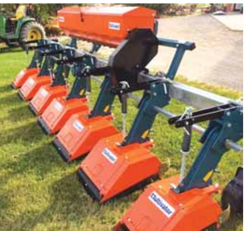
Ford Multivator wider unit shown with optional fertilizer box.

Contact: FARM SHOW Followup, Earl Pancoast, 556 Cross Rd., Salem, N.J. 08079 (ph 856-491-3815).