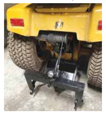
Hitch is bolted to the back of the lawn tractor transmission.

A hitch ball welded to the top of the cross