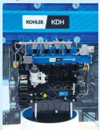
Kohler unveiled its KDH hydrogen engine at Agritechnica.