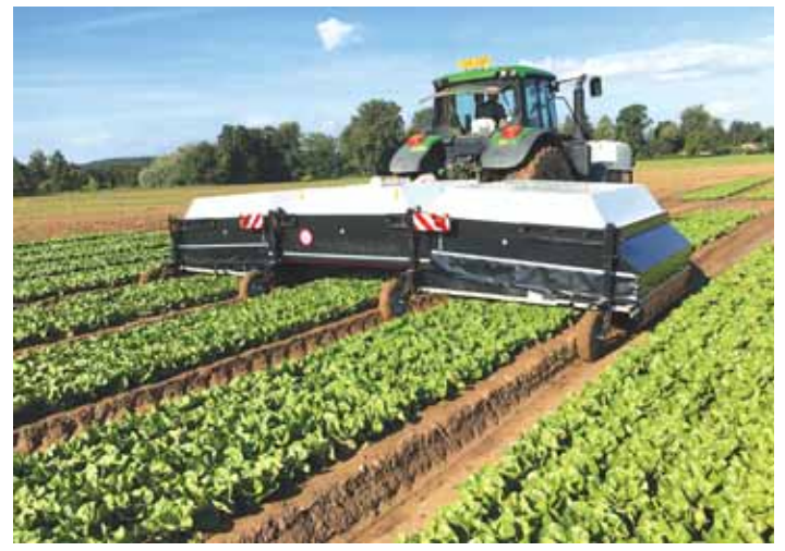
"Our biggest advantage over our competitors is our spray footprint of 2.4 by 2.4 in. It's the most precise sprayer on the market, and combined with chemical reductions, farmers can save a lot of money," says Flury.

All smart sprayers and software technologies are designed and manufactured in Switzerland.