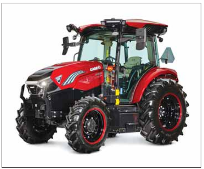
Farmall 75C claims a 4-hr. run time before charging is needed. Three recharging options are available.