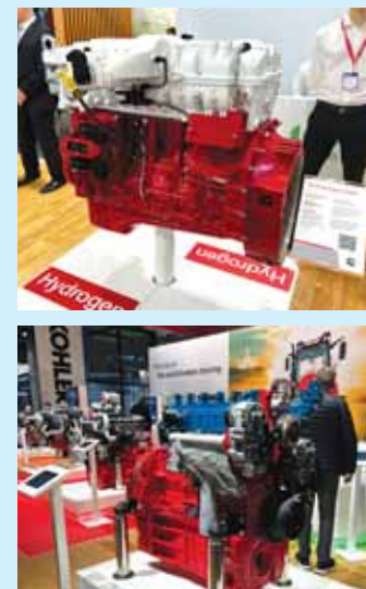
Cummins and Deutz both had Hydrogen engines on display.