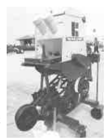
Krause drill is equipped with individual vacuum metering cups on each row.

"It costs only about $2,000 more than our standard 5250 no-till grain drill equipped with fluted seed cups. A 15-ft. model on 7