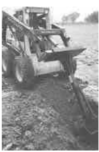
The Skid-Digger bolts in place of the bucket. The angle of the backhoe is set with a pin.

Contact: FARM SHOW Followup, Randy Lackender, Lackender Fabrications, 4645 Naples Avenue S.W., Iowa City, Iowa 52240 (ph 319 351-4415).