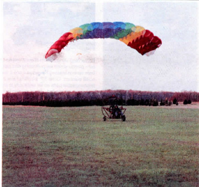
Powered parachute, built and sold in the U.S., steers with simple foot controls.

Contact: FARM SHOW Followup, Stoen Farm supply, Box 155, Lowry, Minn. 56349 (ph 612 283-5283).