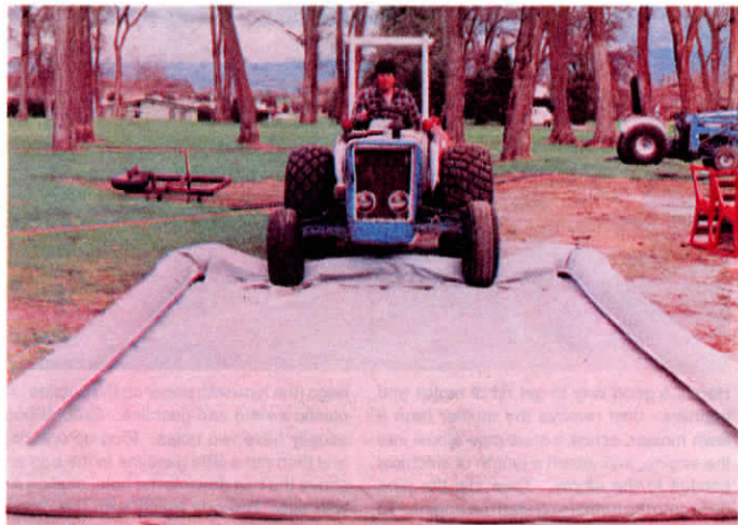
Portable Port-A-Pad can be positioned anywhere. Fits in pickup bed for transport.