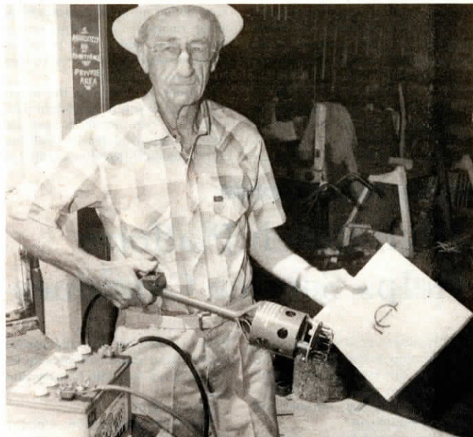
Electric iron gets so hot it makes a more easy-to-read brand that causes less stress to animals.

For more information, contact: FARM SHOW Followup, Hot Flash Livestock Heat Detectors, P.O. Box 307, Gridley, Calif. 95948 (ph 916 846-6212).