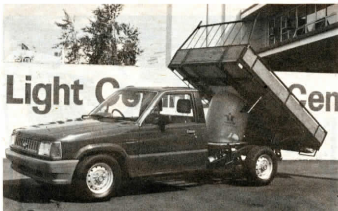
Pickup exhaust inflates inexpensive air bag.