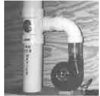
kota 58701 (ph 800 659-1268 or 701 839-5643).

Contact: FARM SHOW Followup, Behrens Construction & Mfg., R.R. 6, Box 227, Country Club Road, Minot, North Da-