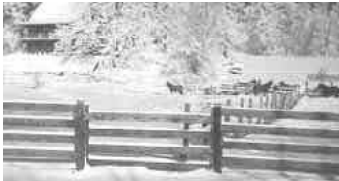
Note simple fence design. Rails overlap on the ends, making construction easier, stronger.