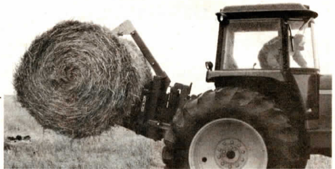
In its bale-carrier configuration top jaw pulls bale in toward tractor.

For more information, contact: FARM SHOW Followup, Michael Duenow, Rt. 5, Box 296A, Fulton, Mo. 65251 (ph 314 642-3646).