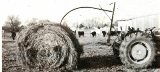
Grapple arm reaches out over bale, pulling it into small, down-low carrying spikes.