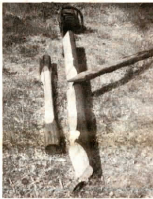
Device points posts or strips fence rails in seconds.