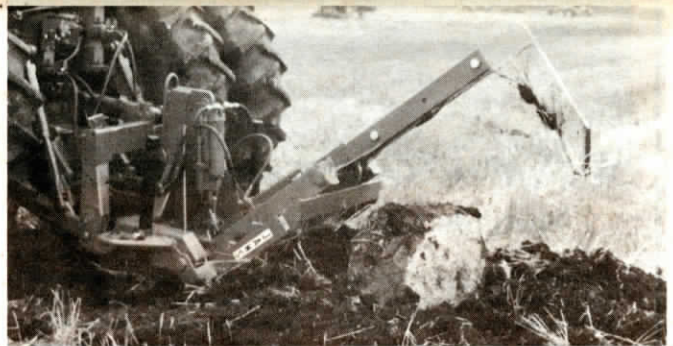
Two teeth go under rock and top grapple arm tips rock-up and out.

For more information, contact: FARM SHOW Followup, Tough-T Mfg., Box 79, Glenfield, N. Dak. 58443 (ph 701 785-2555).