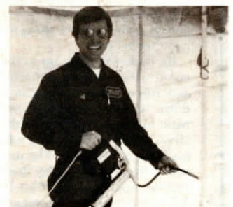
Electric power provides up to 12,000 psi.

FARM SHOW Followup, LubeCon Maintenance Systems, Inc., 6735 West 64th St., Fremont, Mich. 49412 (ph 800 582-3266; in Mich. 800 235-2314; in Canada 616 924-0653).