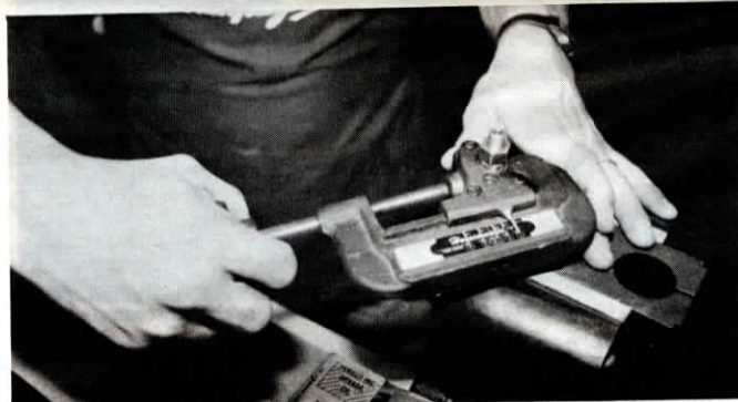
Do-it-yourself kit includes crimp tool, vise block and crimp gauge.

For more information, contact: FARM SHOW Followup, Pinkelman Sales, Hartington, Neb. 68739 (ph 402 254-6529).