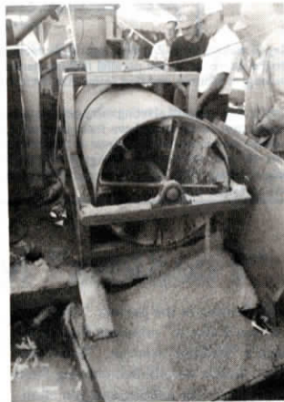
Insta-Pro's extruder retains original oil content and doesn't "cook it out".

Insta-Pro owns several processing plants and offers on-farm extruders for sale or lease. "A farmer can either take his soy-