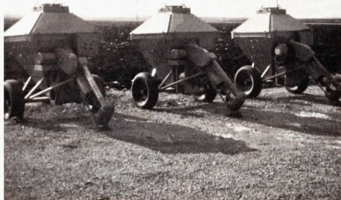
New portable gravity-flow grain cleaner from Grain Care Engineering is available with screens for nearly any grain.

"Suppose your grain (corn) contains 4% F/M and your elevator docks anything over 3% F/M. Instead of