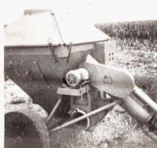
Cleaner features a unique internal proportion bypass that lets you remove any desired percent of foreign matter.

For more details, contact: FARM SHOW Followup, Mike Petri, Grain Care Engineering, 103 West Court Street, Roanoke, Ill. 61561 (ph 309 923-7367 after 4:30 p.m.).