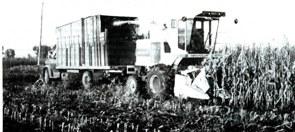
Backward-moving truck follows exactly in chopper's path.