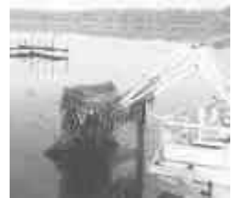
Weeds are scooped up in 4-ft. bucket equipped with stationary sickle blade.

“It’s simple and lightweight. The entire unit weighs only 320 lbs.,” says DeBaker.