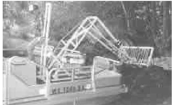
Pontoon-mounted harvester acts as front-end loader to cut, pull and gather weeds.