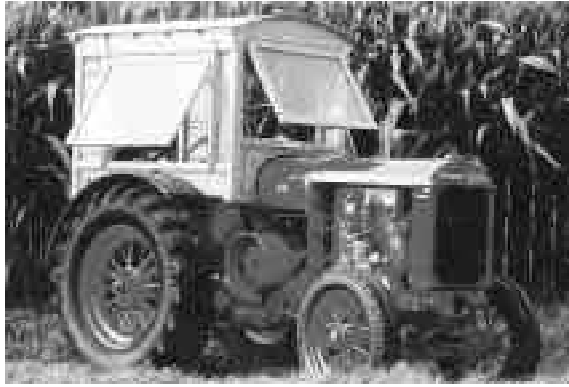
Curly white ash cab features tilt-out windows with locks.

WOODEN CAB MOUNTED ON MCCORMICK DEERING; WOODEN FENDERS ON DEERE H