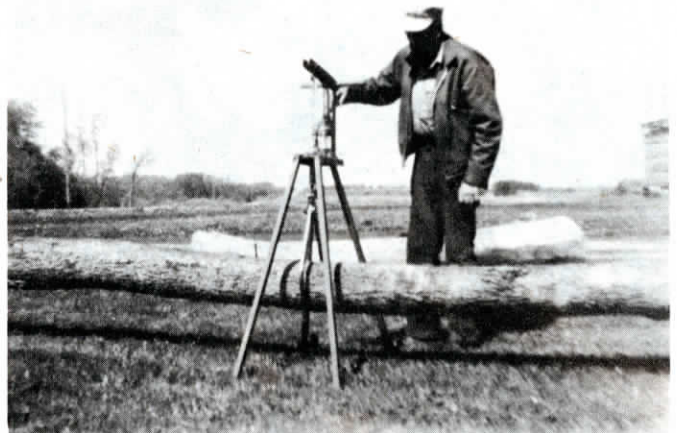
Move-a-Head installed on running gear

Tripod is equipped with an ice-tong type clamp which grabs and holds the log.