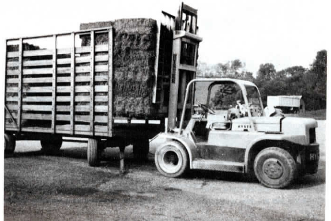
Kokolus built hay wagons with stiff, high sides so he can stack bales on pallets as he bales. He then unloads the stacked bales with a forklift.