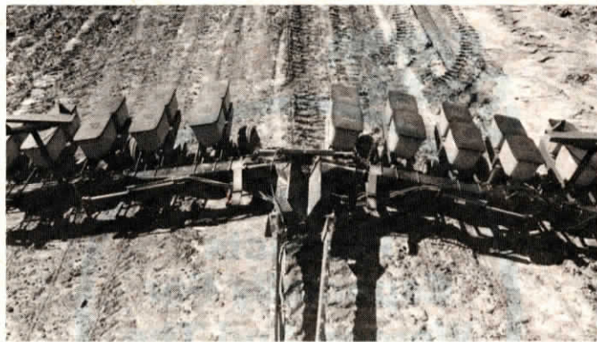
New flex toolbar makes it easy to plant accurately on most any hilly or uneven ground, says manufacturer.