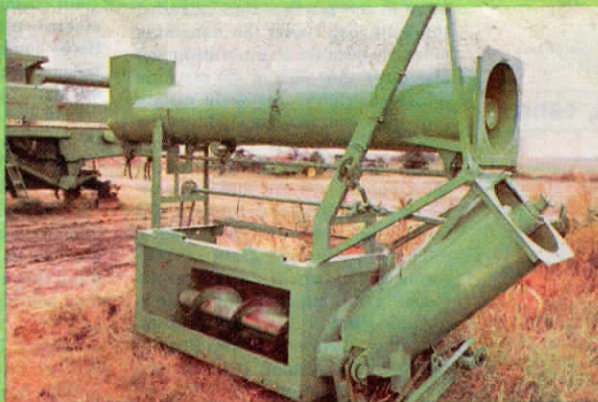
Elevating auger folds horizontal for transport.