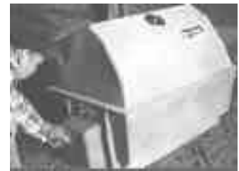
A 110-volt heater and fan circulates warm air through the warmer.

it easy to open up to place the calf inside.