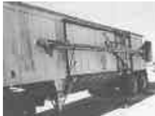
Auger folds neatly against side of trailer for transport.

"The trailer does not have to be parked in one spot since the auger can be easily adjusted and locked into place. The auger is 26 ft. long and its 8-in. diameter gives it excellent capacity. It comes with a flexible rubber downspout and is hydraulic driven