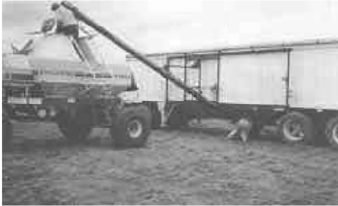
The 8-in. dia. auger is 26-ft. long. It attaches to semi truck hopper bottom.