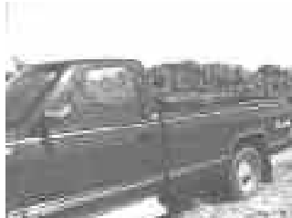
Unique pickup toolboxes mount on siderails.

One popular accessory is an aluminum "boot box" for semi tractors. It serves as a storage container for dirty footwear and miscellaneous truck tools such as chains, binders, greasy tire jacks, crowbars, etc., and