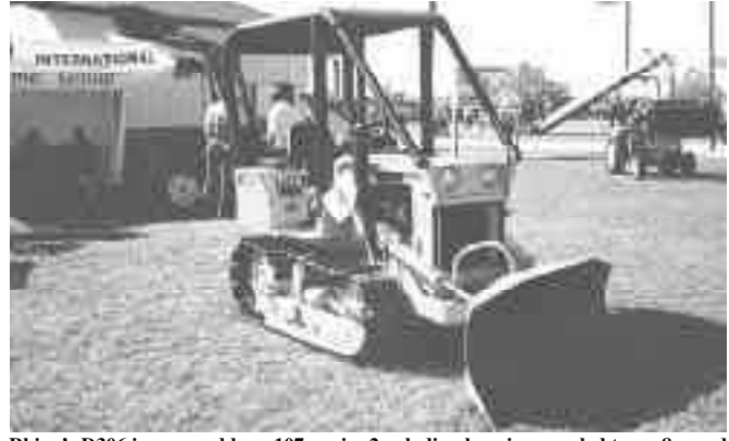
Rhino's D306 is powered by a 107 cu. in. 2-cyl. diesel engine coupled to an 8-speed transmission.

Contact: FARM SHOW Followup, Gro Master, Inc., 3838 North 108th St., Omaha, Neb. 68164 (ph 800 262-6787 or 402 493-4211; fax 402 493-4550).