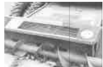
A rubber skirt at bottom of device keeps cobs in header.