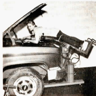
Controls at upper end of platform allow mechanic to adjust position of lift.

Unit requires a 110-volt outlet and a 100 to 150 psi air line. "We used air-over-hydraulics because it's the smoothest way to move the platform. Moves quiet and steady," points out Hill, who sells the unit factory direct for $1,300. In the raised position it'll clear 57 in., high enough to work on all pickups and most 2-ton grain trucks. He plans to introduce a higher-lifting model for semi-trucks in the future.