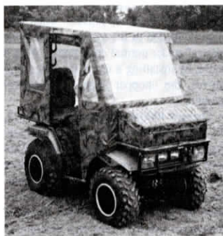
Vinyl cab stretches over PVC frame. Four bolts secure it to ATV frame.

For more information, contact: FARM SHOW Followup, K & R Distributing, Inc., 1404 W. Church St., Marshalltown, Iowa 50158 (ph toll-free 1 800 383-3908).