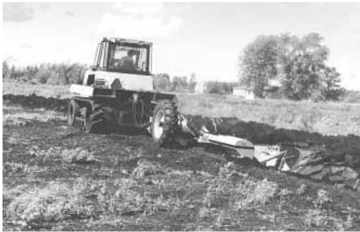
Horodynsky's plow weighs 6 tons and is equipped with a single 10-ft. long moldboard that makes a 48-in. wide furrow. Plow rides on a pair of 28 by 14.9 lugged tires.