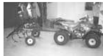
Toolbar comes equipped with cultivator.

"It's very cost effective," says Hubscher. "A 3-pt. hitch alone can cost as much as this