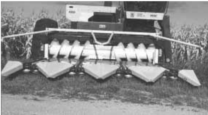
Head is equipped with self-sharpening rotary knives that cut off corn stalks and feed them into a cross auger. The low profile allows head to scoot right under down corn.