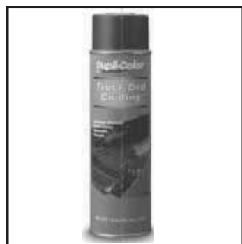
Coating can be sprayed onto pickup bed, fenders, tailgate, and bed rails at far less cost than buying a bed liner.

For more information, contact: FARM SHOW Followup, Dupli-Color Products Group, Sherwin-Williams Diversified Brands, Inc., 31500 Solon Road, Solon, Ohio 44139 (ph 800 247-3270).