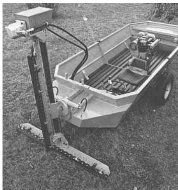
Water weed cutter tilts 90 degrees either way for cutting weeds along banks. Removing weeds from ponds increases oxygen availability.

Contact: FARM SHOW Followup: Dragoni Costruzione Macchine, Via Enrico Toti, 1, Zorlesco Milano, Italy Tel: (0377) 89004.