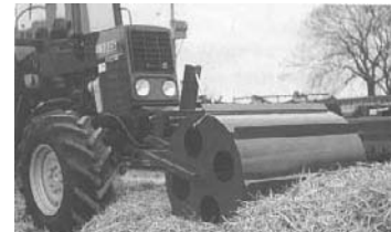
Straw windrows that might otherwise be difficult to bale can be flattened right ahead of baler with this new front-mount roller.

Contact: FARM SHOW Followup, Sieve Services, Fen Lane, Long Bennington, Newark, Nottinghamshire NG23 5ED United Kingdom.