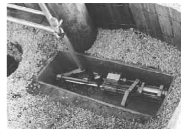
Water pressure powers the cylinder that activates this unique gate opener.

Contact: FARM SHOW Followup, Wautogate, Koeke Industries, P.O. Box 153, Taihape, New Zealand.