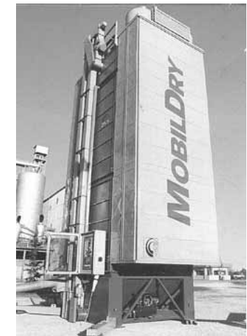
Big new mobile dryer is transported with a trailer chassis that lowers it down to the ground for transport.

The three available models are called the Mobil Dry 8, 10 or 16 with unit heights of 24, 27, or 36 ft.