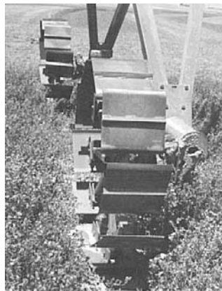
Hinged steel pads "walk" over soft ground with less compaction than wheels.

Contact: FARM SHOW Followup, Pivot Products Co., Box 591, Muleshoe, Texas 79347 (ph 800 288-1805) or Addison Mfg., Inc., 16305 R Rd., Cimarron, Kan. 67835 (ph 316 855-2117).