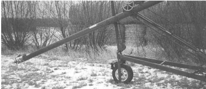
Gamble's self-propelled auger operates with a battery-powered motor off a combine.