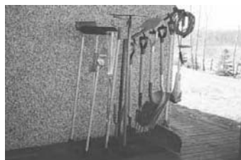
Some tools hang from hooks. Others stand in tube-type holders.

Newman sells the tool holders for $99 (Ca-