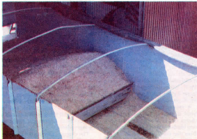
Photo from above shows how unloader drags grain to rear of trailer.

For more information, contact: FARM SHOW Followup, MR Unloading Systems, 10670 Warren Road, Plymouth, Mich. 48170 (ph 313 459-1939).