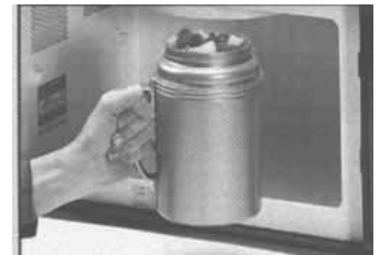
Aladdin Industries Inc., 703 Murfreesboro Road, Nashville, Tenn. 37210 (ph 800 251-4535; fax 615 748-3105).