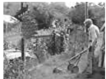
Once wheel kit is installed, string trimmer wheels around the yard like a mower.

Contact: FARM SHOW Followup, Fricke Manufacturing Co., P.O. Box 14, Harrison, Ark. 72601 (ph 800 222-9207 or 501 427-5577, evenings).