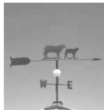
Sahl can put your favorite tractor on a weather vane or your favorite livestock.