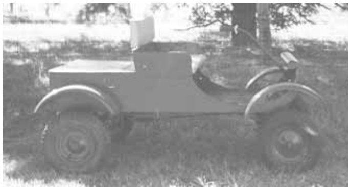
Powered by a 3 1/2 hp Kohler engine, Krueger's go-cart hits speeds of up to 10 mph.