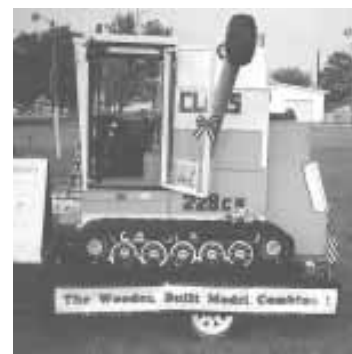
The "Claas" features a grain auger made of a cardboard tube and rubber tracks off a Case-IH skid steer loader.

The 5-ft. high by 3-ft. wide sides of the combine fold down to just 34 1/2-in. high on each side. The driver's side has actually a 5-in. dia., 10-ft. long grain auger - a cardboard tube donated by a local carpet outlet - extending out at a 45 degree angle. A grain spout is fashioned from a 14-in. long plastic pretzel can and is painted black. The auger system has a flood light that runs off one of two