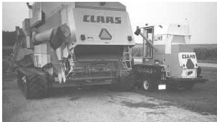
Photo shows Wendel's wooden Claas combine trailing alongside the real thing.

Contact: FARM SHOW Followup, Avery K. Sahl, 3823 Shera Bay, Regina, Sask., Canada S4S 7E5 (ph 306 586-8149).