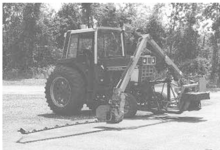
Mower boom pivots at two points and can reach out up to 18 ft. to cut road sides or to trim low-hanging branches. Sicklebar and head can be used vertically or horizontally.

"It's a very versatile system that lets one tractor do more than one job, resulting in big cost savings," says Moore. "The snowblower drive train always stays with the tractor, even during the summer. It takes only about 10 minutes to switch from the mower to the