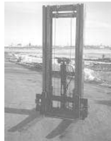
Forklift is ideal for unloading bulk seed bags because it has a 14-ft. reach and easily handles 3,000 lbs.

Sells for $3,250 plus S&H. The optional hydraulic center link sells for $165 plus S&H. Contact: FARM SHOW Followup, Crary Co., Box 849, W. Fargo, N. Dak. 58078 (ph 800 247-7335 or 701 282-5520; fax 9522; website: www.crary.com).