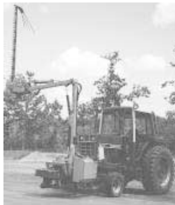
A 9-ft. sicklebar mounts on hydraulic-powered pivoting boom on front of IH 2-WD tractor.

They bought a 3-pt., pto-driven McConnell boom mower equipped with a 4-ft. long flail-type cutter head designed to remove brush from roadsides. A home-built adapter allows the boom mower to be mounted on the same carrying frame that supports the snowblower