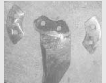
Kit consists of two shims per tine.

"Once converted, much less ballast is required and the horsepower requirement is reduced 25 to 30 percent. Tines wear