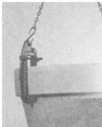
Fiberglass clamps fit rim of any standard pot.

Contact: FARM SHOW Followup, Canson's Clay Pot Hangers, P.O. Box 997, Marshall, Texas 75671 (ph 800 272-6997; Website: www.claypohanger.com).