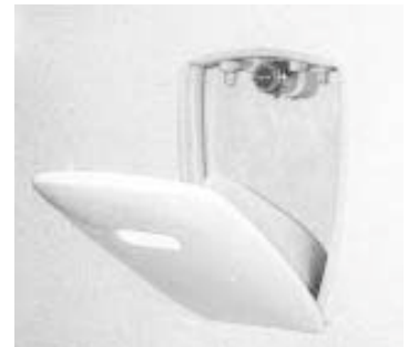
Porcelain urinal mounts between 2 by 4-in. studs.

Contact: FARM SHOW Followup, Mister Miser, 4901 North Twelfth Street, Quincy, Ill. 62301 (ph 217 228-6900; fax 6906; Website: www.mistermiser.com).