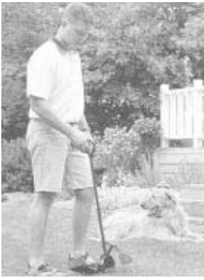
Scoop consists of a 34-in. long handle fitted with trigger-activated rake arm on bottom.