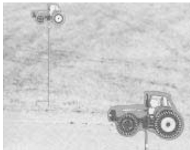
Distel also makes these reflective tractor driveway markers. They sell for $24.95 apiece plus S&H.