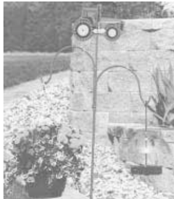
Tractor rain gauge pole is available in Deere green or Case-IH red.

Contact: FARM SHOW Followup, Distel Grain Systems Inc., P.O. Box 108 LeSueur, Minn. 56058 (ph 800 426-1848 or 507 665-6776).