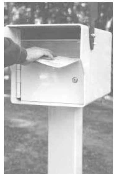
Mailbox has two compartments, a non-lockable one on top for outgoing mail and a lockable one on bottom for incoming mail.

The company also offers a 1/4-in. thick steel newspaper tube that mounts on the post. It sells for $79 plus S&H.