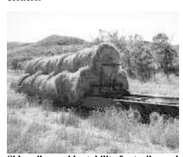
Side rails provide stability for trailer and also make a track for the push-off bar to

gave up on the loading arm," he says. He keeps track of loading time, which varies according to terrain and density of the bales. If the bales are close together, though, he can load it in less than 10 minutes.