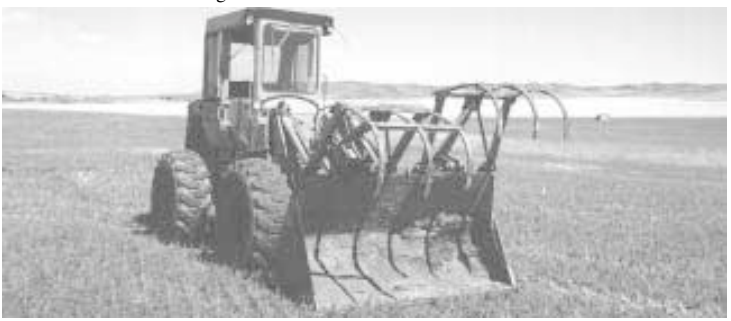
Modified payloader has two independently controlled grapple forks for fast loading.

Contact: FARM SHOW Followup, Kevin Brown, Box 301, Beach, N. Dak. 58621 (fax 701 872-3410)