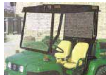
Canopy is made from ABS plastic and has reflectors on each corner for increased road safety. A hard-sided cab can be installed with or without the ROPS.