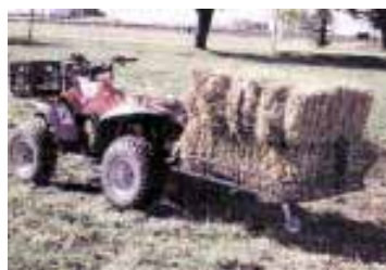
Works great for hauling bales of hay.