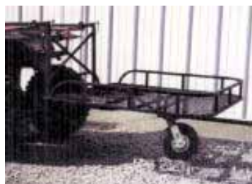
Backpack attaches to ATV's rear rack. Here it's shown in load position.

over the doors. The tank cost $450 plus $300 to have it hauled and placed up on end. The silo, which we store corn silage in, sits on a gravel base. There's a 40 by 2-ft. concrete apron around it, and we simply use a pitchfork to pitch silage out of the silo onto the feed area. (Steve Carpenter, 3791 Cooperider Rd., Somerset, Ohio 43783; ph 740-743-2902)