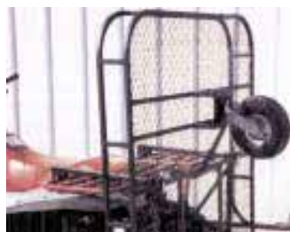
Backpack in upright transport position.