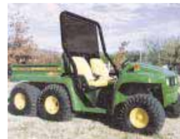
Rollbar includes seat belts for both occupants as well as an expanded metal back screen for protection from shifting cargo.

Contact: FARM SHOW Followup, Femco, Inc., 500 North 81 By-Pass, McPherson, Kan. 67460 (ph 800 677-0898 or 316 241-3513; fax 3532).