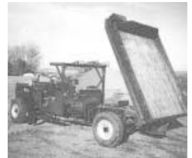
Dumping rocks off the 6 by 7-ft. flatbed is as simple as pulling a lever in the cab.

brake lights on it as well as license plates so I can drive it on the highway. I also use it for other jobs such as hauling seed, etc. I recently mounted hydraulic outlets on back so that I can operate an orbit motor and auger, allowing me to deliver seed from my gravity wagon to my planter. I also plan to build a trip tail-