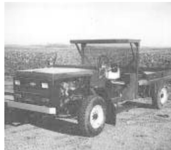
Easy-to-load "rock wagon" was built out of a 1974 Chevy 3/4-ton 4-WD pickup.

Contact: FARM SHOW Followup, Warren Jenneman, 10200 100th St. S.W., Minot, N.Dak. 58701.