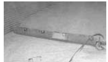
In-bin sweep auger can be disassembled and moved from bin to bin, allowing you to use one sweep auger for all your bins.

Contact: FARM SHOW Followup, Norwood Sales, Inc., 102 Sunflower Ave., Cooperstown, N. Dak. 58425 (ph 800 446-0316 or 701 797-3684; fax 3685).