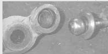
Ball ready to be reinserted (above) and completed end (below).

"I did the first rod end two years ago and