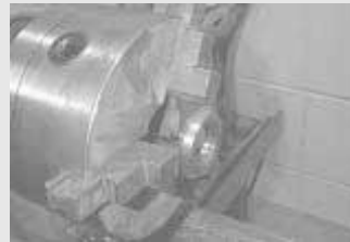
New socket cap in lathe.

cap part off the end and mig-welded mine on in place.