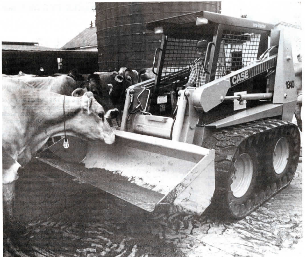
Goodyear has already started selling rubber tracks that mount on existing skid steer loaders. Tracks and specially-built undercarriages are being developed for most wheeled equipment, powered or not.

For more information, contact: FARM SHOW Followup, Goodyear, Corporate Headquarters, Akron, Ohio 44316 (ph 216 796-5896).