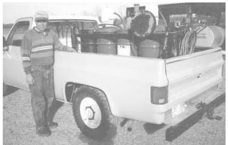
Slide-in “service bed” fits snugly between the wheel wells of Colson's pickup.

The Idea Marketplace For Agriculture www.BestFarmBuys.com