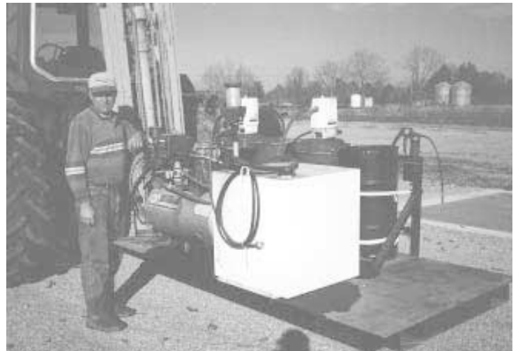
The 4 by 8-ft. metal platform is fitted with a portable air compressor, air-operated grease gun, 50-gal. fuel tank, and three 120-lb. grease drums.

Contact: FARM SHOW Followup, Dwight Colson, 860 Spruill Rd., Caledonia, Miss. 39740 (ph and fax 662 356-6631).