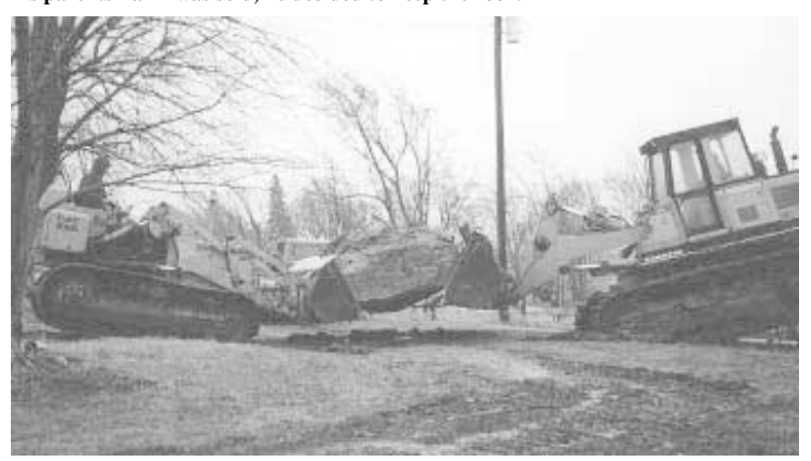
A pair of crawler tractors with buckets were used to load the rock onto a semi trailer for transport.