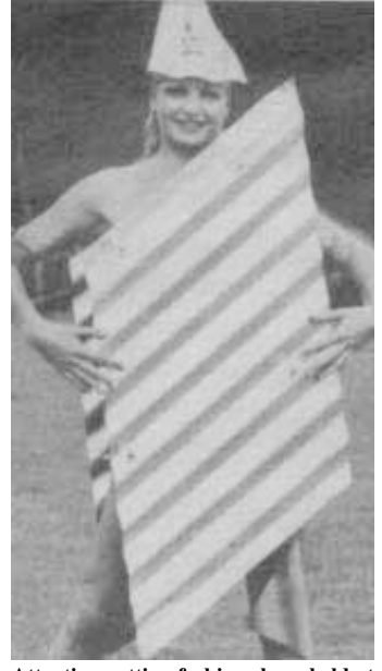
Attention-getting fashion show, held at a major New Zealand farm show, requires contestants to create a piece of wearable art from anything they can find on the farm.

Contact: FARM SHOW Followup, New Zealand National Fieldays, Private Bag 3206, Hamilton, New Zealand (ph 7 843-4499; fax 7 843 8572; Web site: www.mystercreek.co.nz; E-mail: jodib@mysterycreek.co.nz).