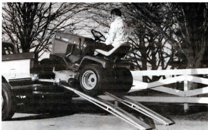
Optional center ramp is available for 3-wheelers.

SHOW Followup; Keeton and Co.; Lyle Keeton, Owner; 1238 Tress Shop Road; Trenton, Ky. 42286.