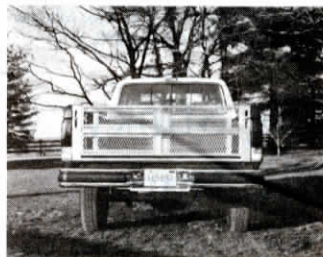
Folded-up ramps serve as gas-saving tailgate when not in use.

Each ramp weighs 47 lbs. and has a load capacity of 800 lbs. An optional center ramp is available for loading 3 wheel ATV's. It's slightly shorter than the two tailgate-forming ramps and can be stored in the cab behind the driver's seat.