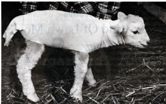
"Body stocking" is made from 30-in. piece of stretch nylon tubing with slits for the legs, tail and genitals.